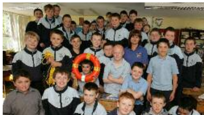
Stradbally Boys National School

Laois Water Safety held their annual presentation of Water Safety Certificates in Portlaoise Leisure centre.