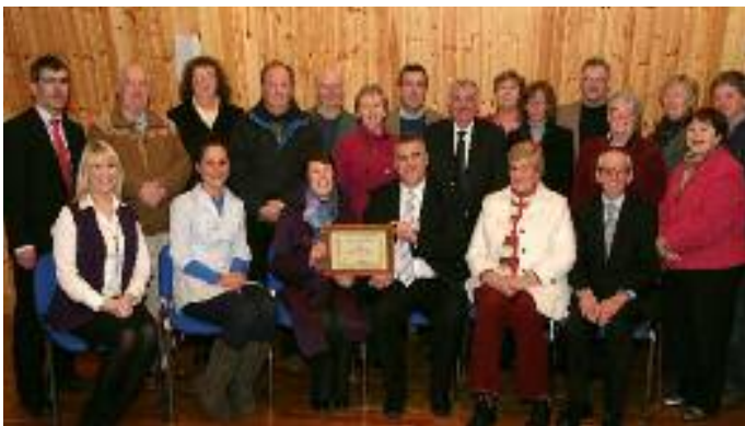
Overall Winners - Clonaslee Laois Hospice 'St Stephen's Day Walk' Committee

Laois Community Forum hosted its first Annual Community Awards Evening in February, 2010 in Portlaoise Parish Centre. The Awards were organised to celebrate the huge contribution made by community and voluntary groups to life in County Laois.