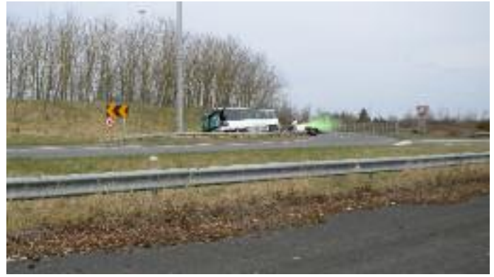
View of fictional accident from Abbeyleix Road

An Inter-Agency Major Emergency exercise, involving the three Principle Response Agencies i.e. Laois Local Authorities, An Garda Síochána and the Health Service Executive, was held in Portlaoise on 23rd April, 2010.