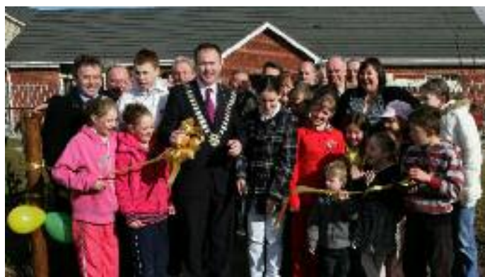
Opening of Croí na nÓg playground in Mountrath

The Multi-Use Games Area on site is suitable for basketball, soccer, tennis and volleyball and has given a new lease of life to the area.