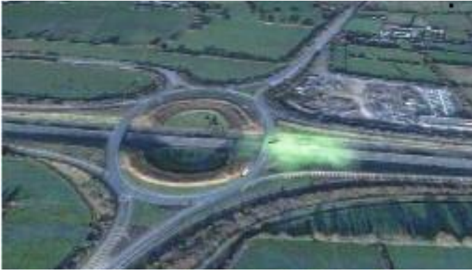
Ariel view of fictional accident at Togher Roundabout