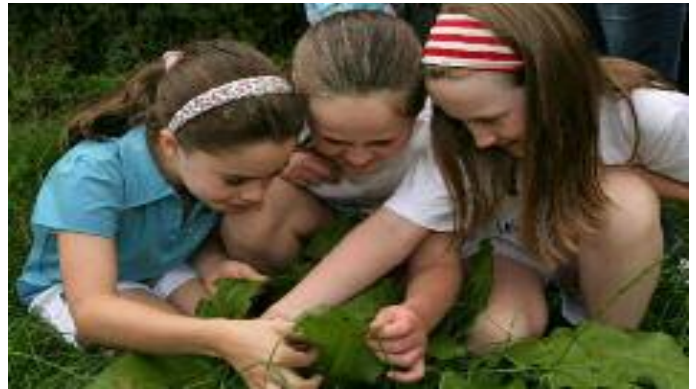
Learning about the wildlife of Laois during Heritage Week

In addition, we are lucky to have a number of State owned heritage sites in the County, including Emo Court, Heywood Gardens and the Rock of Dunamais and of course all of these are open to the public year round as well as holding special events during Heritage Week. Heritage Week is co-ordinated by the Heritage Council with support from the Department of the Environment, Heritage and Local Government and Fáilte Ireland.