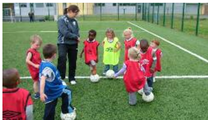
Soccer Tots Programme