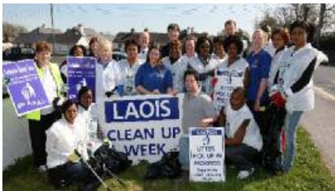
Laois County Council staff team up with the PAL (Portlaoise Against Litter) Committee and the Laois Ethnic Minority Support Group to put litter in its place

Clean up Laois Week took place in April, 2010 and hundreds of people and school children took to the streets throughout the county to clean up their estates, streets and communities. This year, approximately 38 tonnes of waste was collected (some of which was illegally dumped waste) by 93 registered groups. In total, €13,000 was spent on 'Clean Up Laois Week' activities, including the distribution of litter pickers, gloves and bags to groups and the correct legal disposal of the collected material by the Environmental Enforcement Officers.