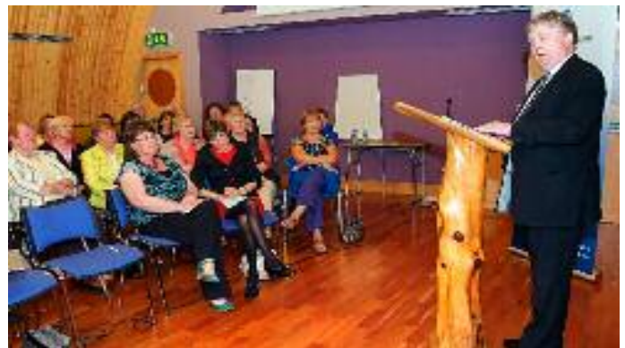
John Moloney T.D., Minister with Responsibility for Disability & Mental Health, addresses the Awareness Evening

"Work well, Live well, Be well" was the theme of an awareness evening held by Laois Community Forum in Portlaoise Parish Centre on 17th May, 2010, to highlight the importance of 'Minding Our Mental Health'. The feedback from this evening was very positive and worthwhile.