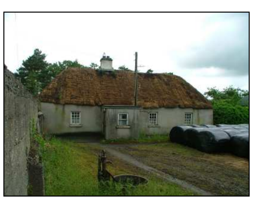
Oaten straw roof at The Waterfall, Vicarstown