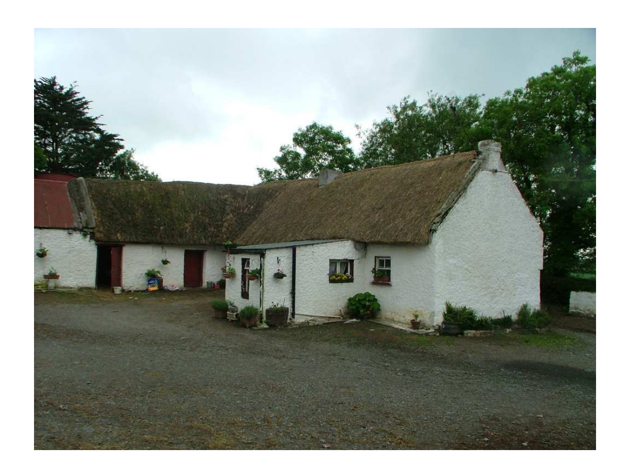
Report compiled by Architectural Recording and Research October 2007

"An Action of the Laois Heritage Plan 2007-2011"