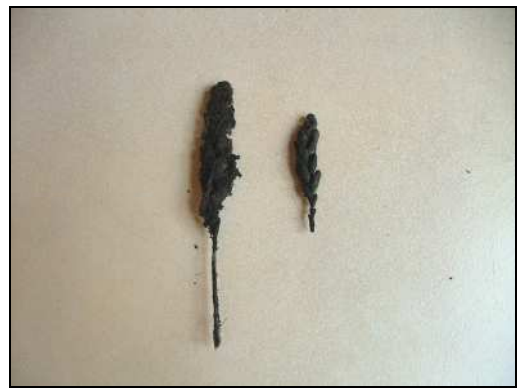
Ears of wheat from base coat at Fishermans Inn

To retain the visual character of the county's thatched roofs, a concerted effort should be made on the parts of both thatchers and owners to use oaten straw when re-thatching in County Laois.