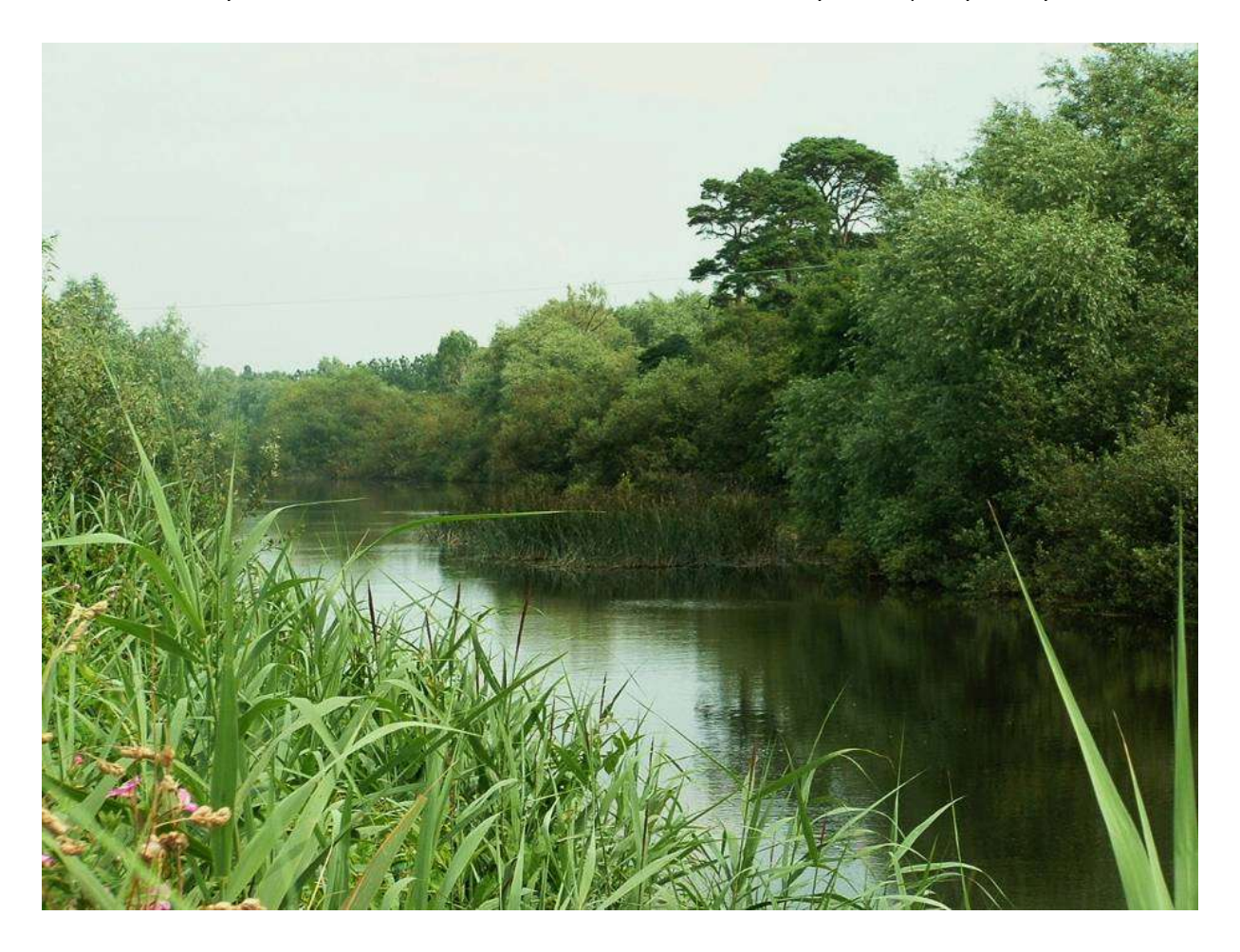
Fig. 5. Depositing/lowland rivers (FW2), River Barrow flowing through the townland of Crossneen (Grid square S7175, Target note 1).