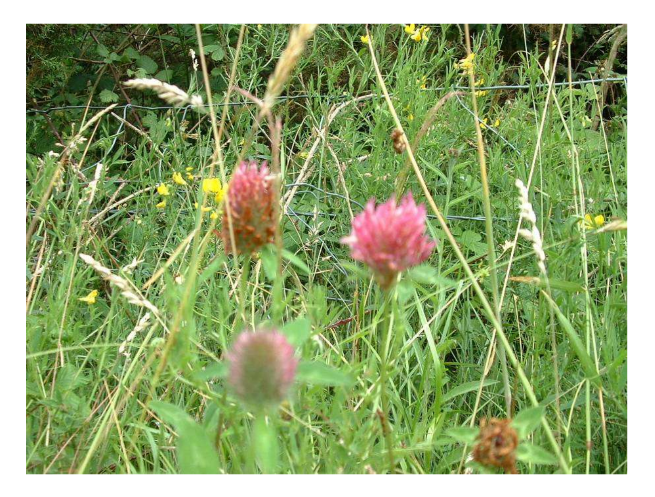
Fig. 6. Dry calcareous and neutral grassland (GS1) in a hollow not far from the River Douglas in Kilcruise (Grid square S6184 Target note 1)

The dry calcareous and neutral grassland in the quarry (Kilbride) contained at least 65 different species and in addition to bee orchid species included carline thistle, kidney vetch, downy oat grass, yellow oat grass and marsh helleborine. Even though species numbers were high in dry calcareous and neutral grassland nearly all of the areas in which it occurs are degraded due to disturbance some of which has been caused by land reclamation or as in Kilcruise (Grid square S6184 Target note 1, Fig. 6.) where small scale quarrying of shingle occurred. The dry calcareous and neutral grassland in Kilbride was an exception as it was relatively undisturbed and was not in receipt of fertiliser.