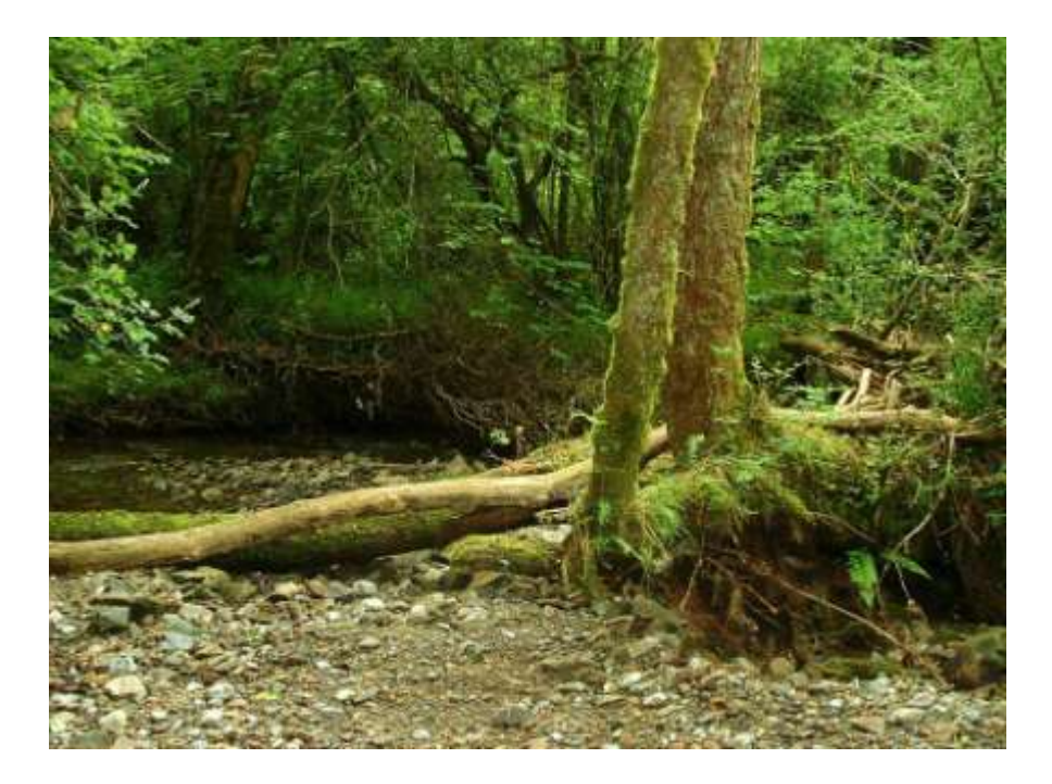
Fig. 13. Oak-ash-hazel woodland (WN2) beside the River Douglas in Kilcruise (Grid square S6284, Target note 1)

Although not an NHA, the wood on Killone hill (townlands of Killone, Kilmurray and Ballythomas) is species rich (34) and overall shows few signs of disturbance. Hazel was the main tree/shrub species while ash and hawthorn were frequent. Other woody species included beech, spindle, holly, blackthorn and dog rose but only in small numbers. There was very little bare ground in this wood as there were no farm animals present, however deer are known to browse here but grazing pressure is low. Wood sanicle and bluebells were abundant on the woodland floor, while woodruff and soft shield fern were also frequently found. The grass wood melick was also found though only occasionally.