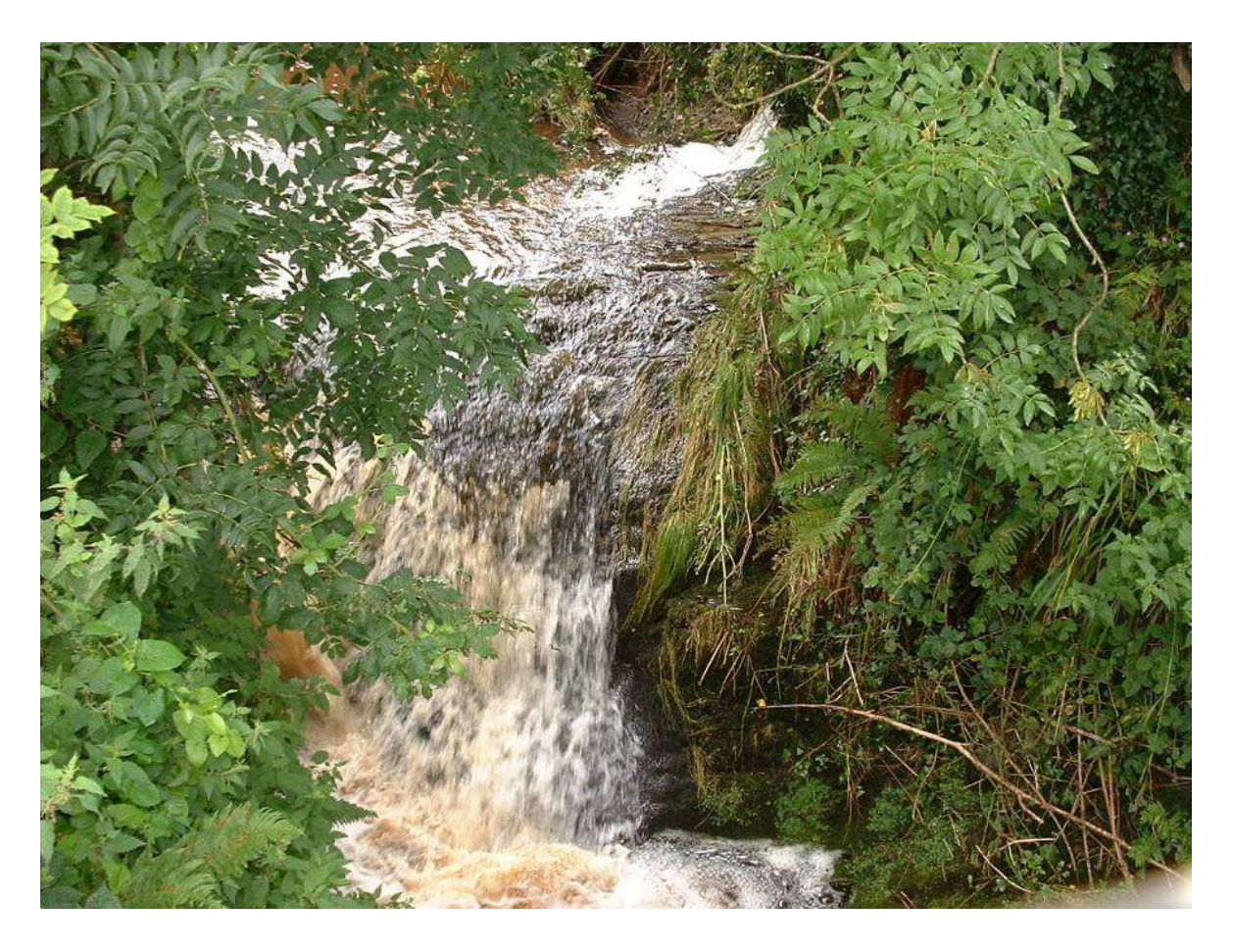
Fig. 4. Eroding/upland river (FW1) The Fushoge, in Killeshin (Grid square S6777 Target note 2) flowing through a narrow gorge with oak-ash-hazel wood on either side.