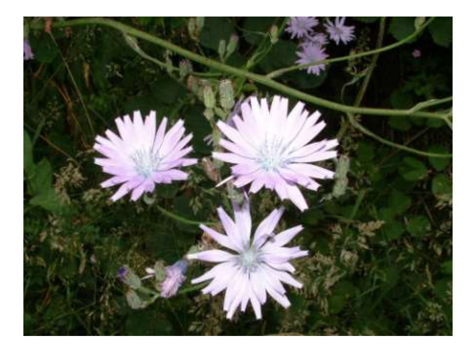
Fig. 3 Blue sowthistle (Circerbita macrophylla), an invasive garden escape found growing in grass margin in Mayo (Grid square S6175) and in Monavea (Grid square S6275).

Blue sow thistles were recorded in Mayo S6175 Target note 1 and in Monavea S6275 Target note 1, growing on the roadside verge next to an abandoned dwelling.