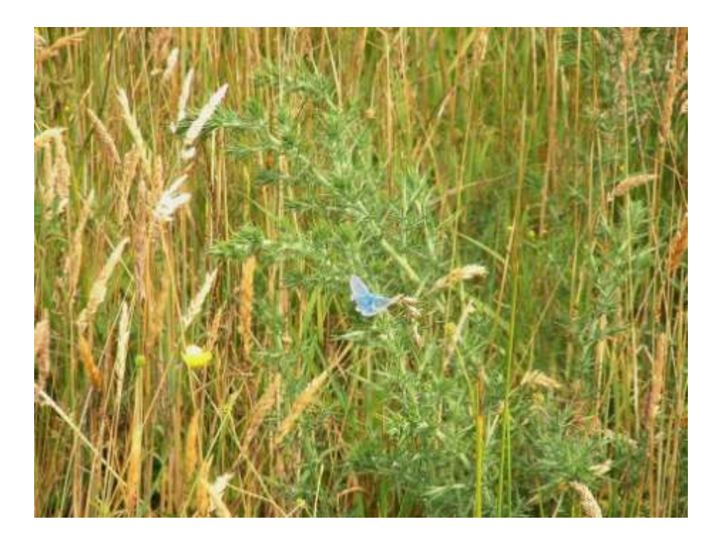
Fig. 8. Dry-humid acid grassland (GS3) in Ardateggle (Grid square S6476) with common blue butterfly resting on gorse bush.

In 2008 dry humid acid grassland was recorded from several townlands on the Castlecomer Plateau including Rossmore (Grid square S6675, Target note 1, on peaty soil, Grid square S6673 in a mosaic with wet heath, recolonising bare ground hedgerows and earth banks, Target note 3), Ardateggle (Grid square S6476, Target note 2, Fig. 8) and in Monavea and Gortahile. Additional species recorded in 2008 include wild angelica, spear thistle, bird's-foot-trefoil, heath spotted orchid and squirrel-tail fescue.