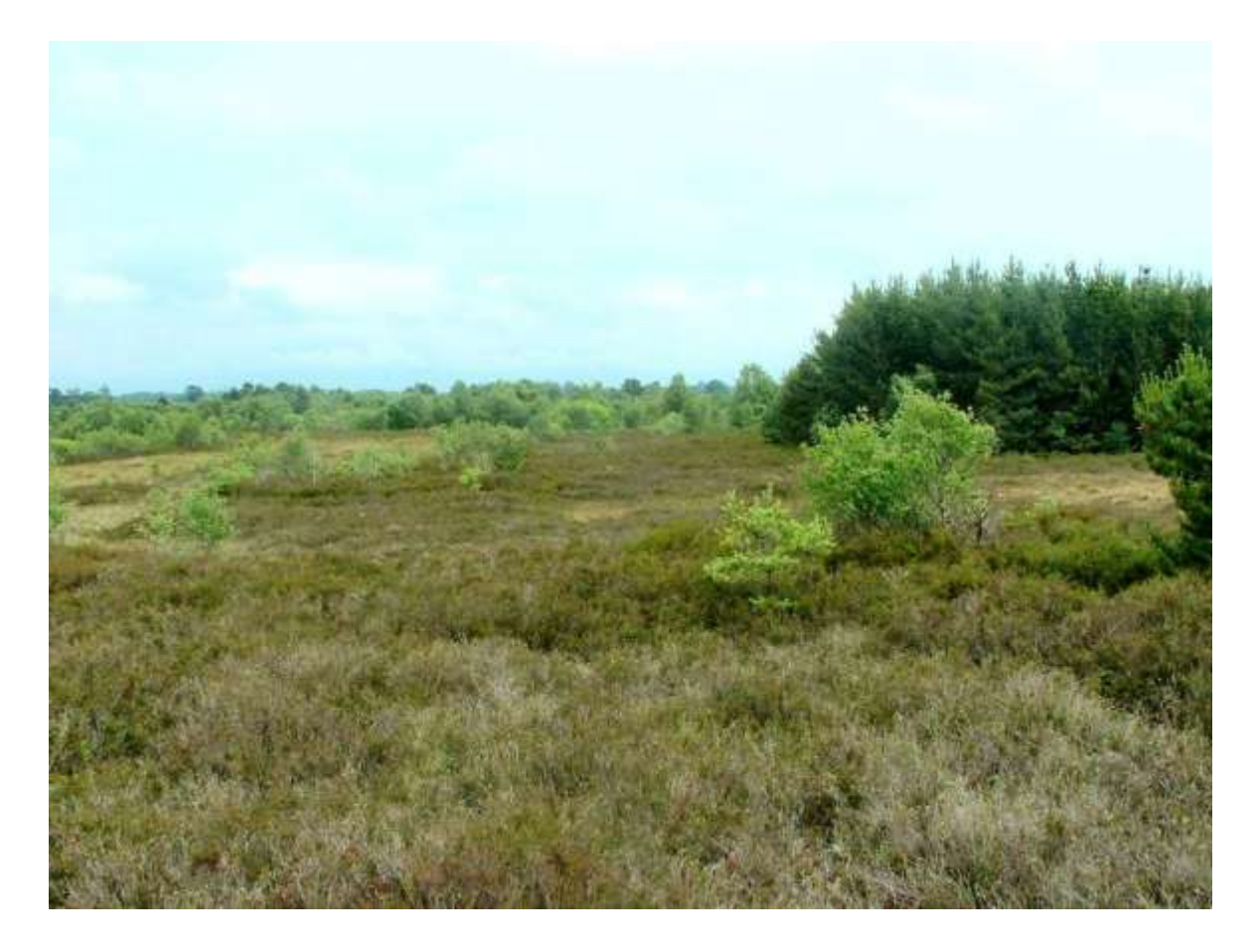
Fig. 12. Raised bog (PB1) habitat in Garryvacum (Grid square N5507 target note 10), with ling and deergrass among the species found there.