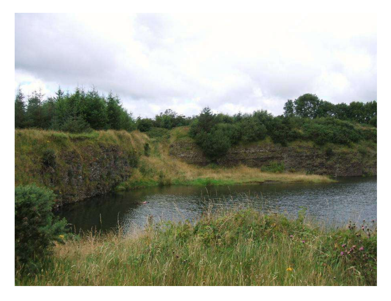
Fig.16. Exposed siliceous rock (ER1) in Farrans (Grid square S6082, target note 2), with scrub growing on top of the banded shale rock face.

Exposed siliceous rock was surveyed for the first time in 2008 and was found in one location in Farrans in an abandoned quarry (Grid square S6082, target note 2, fig. 16). Nine species were recorded but this was from some distance as it was not possible to get close due to the pond in front of it. Identified species included gorse, honeysuckle, ivy, saxifrage and tormentil. Ferns and grasses were also growing on the rock face but it was not possible to accurately identify them.