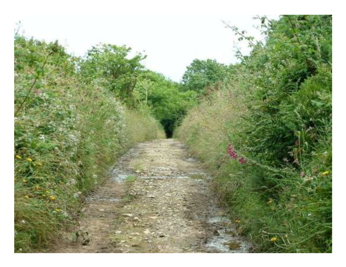
Fig. 17. Earth banks (BL2) flanking either side of laneway in Clogrennan (Part of), (Grid square S6473BL2).

Before 2008 the total length of earth bank habitat was 5.51 km or 0.24% of all linear habitats, however this increased by more than 16 times to 89.74 km in 2008 and represented 2.39% of the linear habitats in the survey area (Table 7). Earth banks were ubiquitous throughout the south east of County Laois and were found in most townlands along road and lanes (Clogrennan (Part of), (Grid square S6473, target note 1, fig.17), in Kilcruise (Grid square S6183, target note 1) and in Farnans (Grid square S6181, target note 2). Fifty six species were identified from earth bank habitats and included woody species such as hawthorn, ash, blackthorn, bilberry and holly. Yew was recorded in Farrans (Grid square S6181, target note 2), and is a fairly new addition to the earth bank according to the landowner. Herbaceous species include knapweed, foxglove (fig. 17), bush and tufted vetch along with several ferns such as hard fern, broad buckler fern, male fern and lady fern.