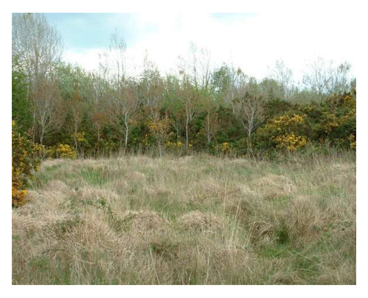
Fig. 11. Wet heath (HH3) habitat in Morett (Grid square N5404, target note 3), dominated by purple moor-grass, which is being invaded by brambles and gorse scrub.