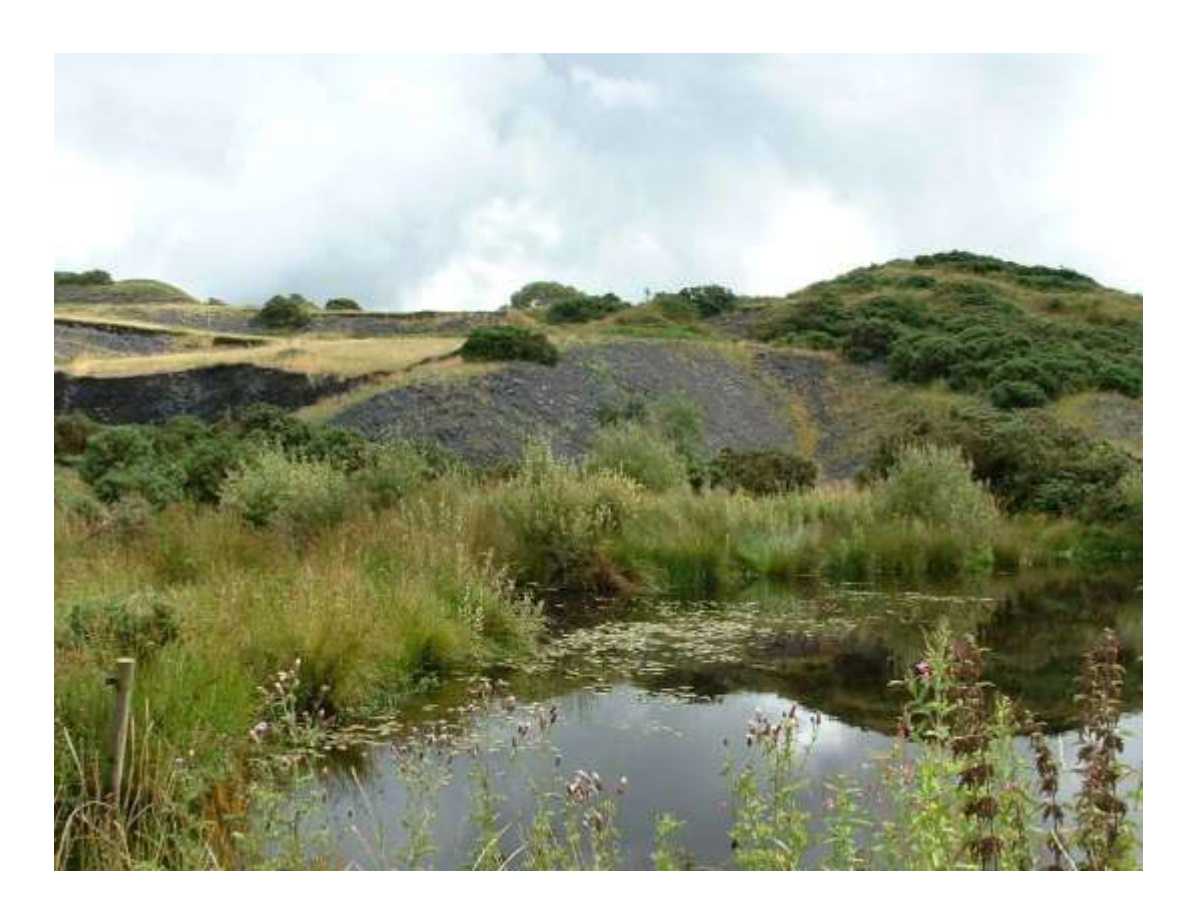
Fig. 14. Scrub (WS1) growing in an abandoned coalmine in Garrendenny (Grid square S6075).