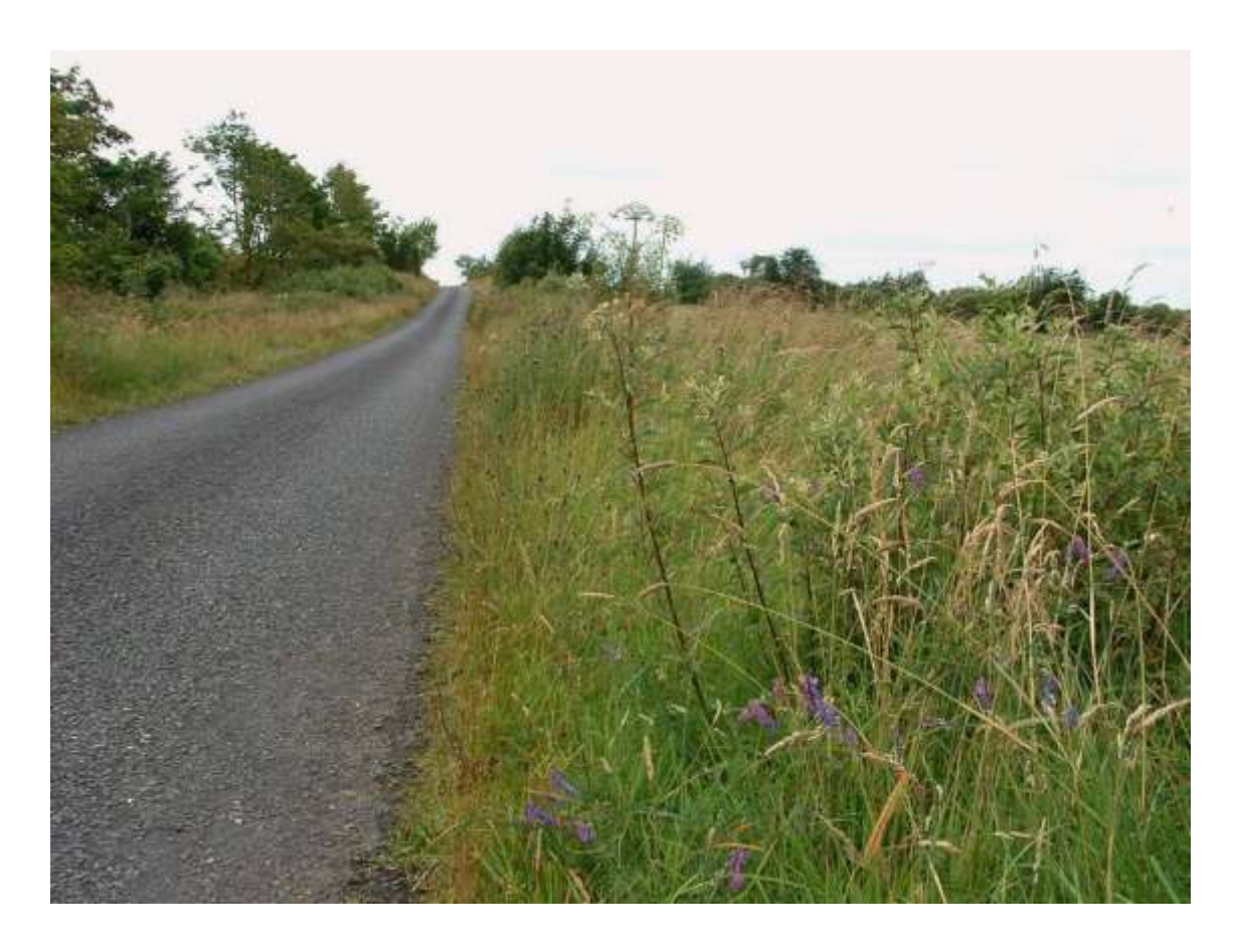
Fig. 7. Dry meadow and grassy verge (GS2) along the road in Monavea (Grid square S6375) with tufted vetch and wild angelica.

Dry meadows and grassy verges were found in at least 20 townlands, beside roads (Killone, grid square N5402, target note 3, Monavea (Grid square S6375, Fig. 7), along laneways (Rathcrea, grid square N5801, target note 9), in graveyards (Tierhogar, grid square N5510, target note 1), overlying small outcrops of limestone in Coolnacarrick (Grid square S5296, target note 1) and beside a section of disused Mountmellick Branch of the Grand Canal in Kilbride.