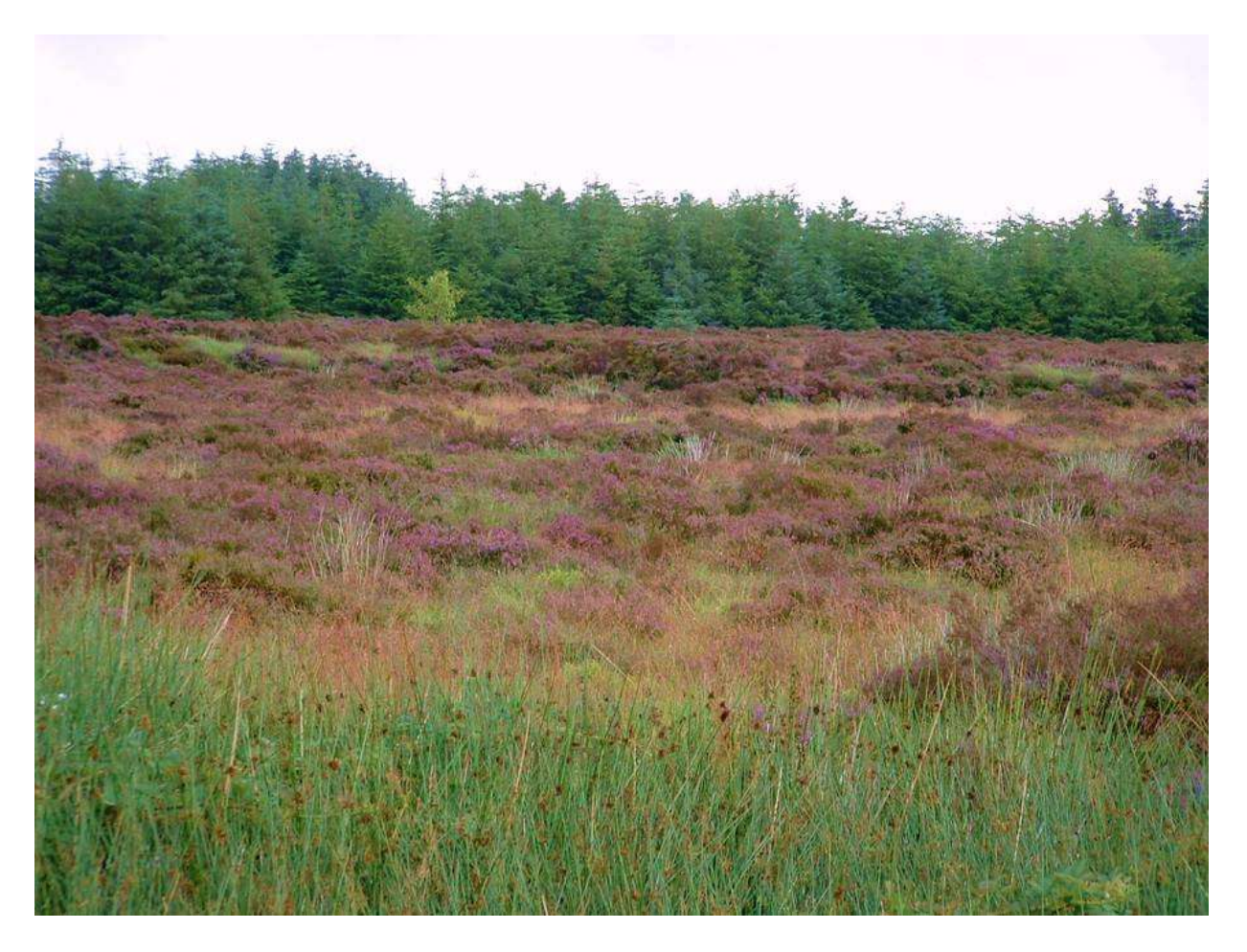
Fig. 10. Dry siliceous heath (HH1) in Ardateggle (Grid square S647612, Target note 1) dominated by ling heather.