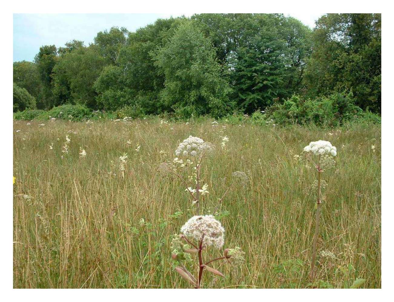
Fig. 9. Wet grassland (GS4) in Inch, Co. Laois (Grid square S5997, target note 1). At least 49 species were recorded in this wet grassland meadow including wild angelica, greater tussock sedge, tall fescue and meadowsweet.