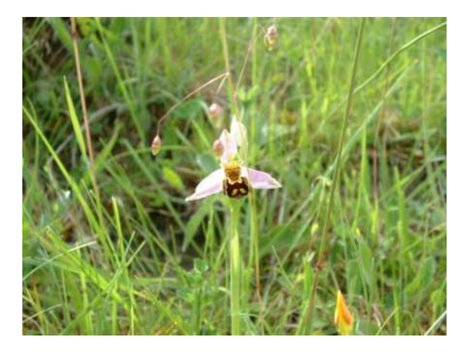
Fig. 2. Dry calcareous and neutral grassland with the rare bee orchid (protected under the Wildlife Act 1976) growing in association with quaking grass and bird's-foot-trefoil in a disused quarry, Kilbride, Co. Laois (GS1, grid square N5209, target note 7).

Among the 464 species, 33 (listed in Appendix 5) are rare regionally and locally. These include the protected bee orchid (Fig. 2); the Red Data Book species (Curtis and McGough, 1988) marsh helleborine and the regionally rare lesser butterfly-orchid, greater butterfly-orchid and mountain everlasting.