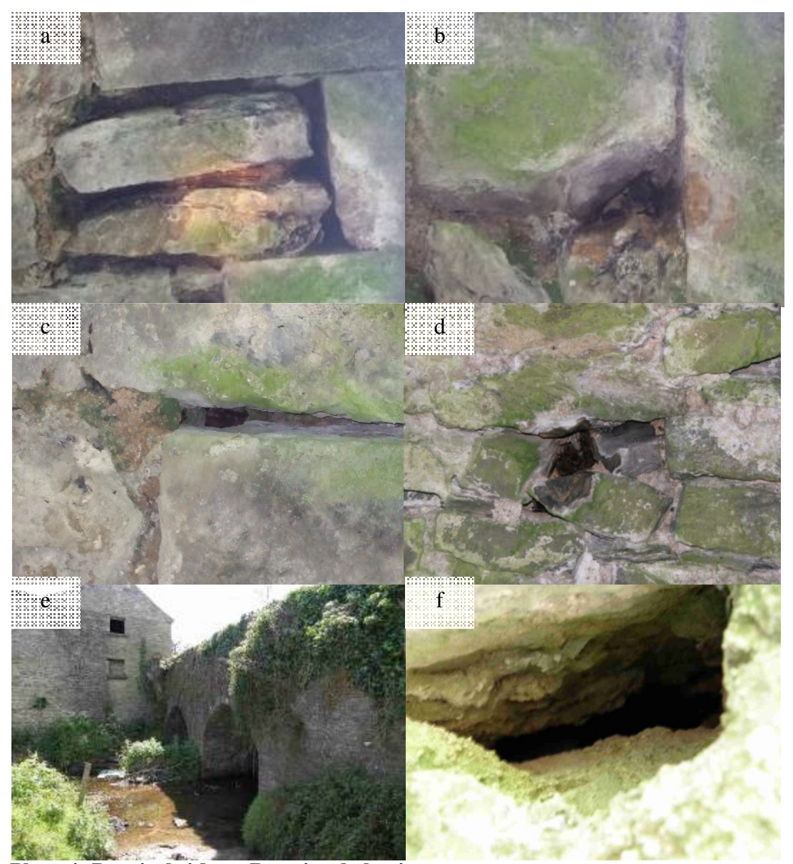
Plate 4: Bats in bridges. Roosting behaviour

Bats avail of masonry arch cavities such as these at Bay Bridge, Laois, a), b) and c) and Dangan Bridge Kilkenny, d) in a similar fashion. The wide cavities are most suitable for large numbers of bats while smaller crevices are used by individuals.