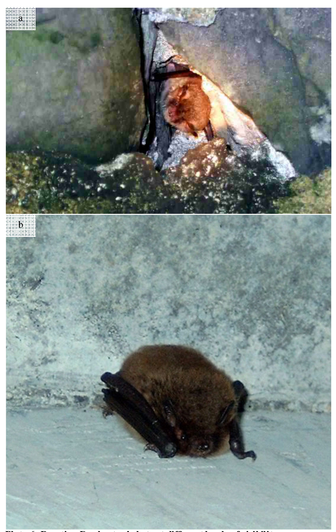
Plate 6: Roosting Daubenton's bats at different levels of visibility Daubenton's bats are most often tucked out of view in a cavity (a) but may on rare occasions be visible externally (b) as in this modern culvert on the Meath / Dublin border.