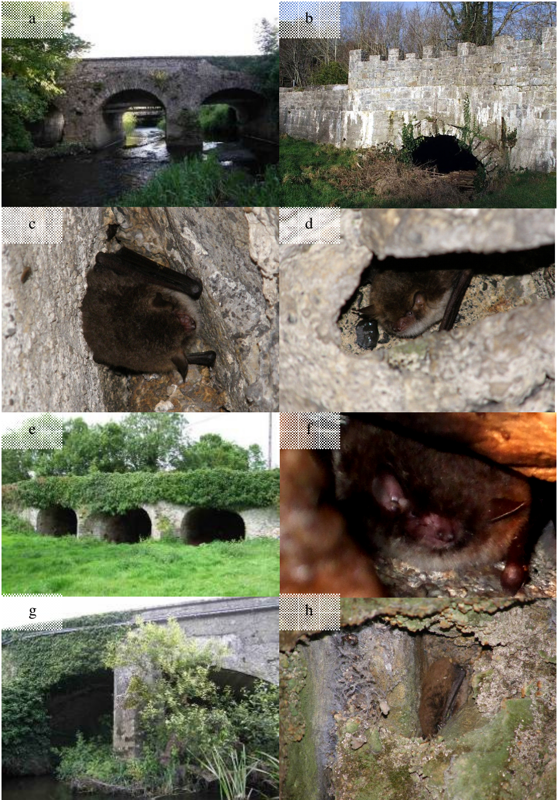
Plate 2: Bat