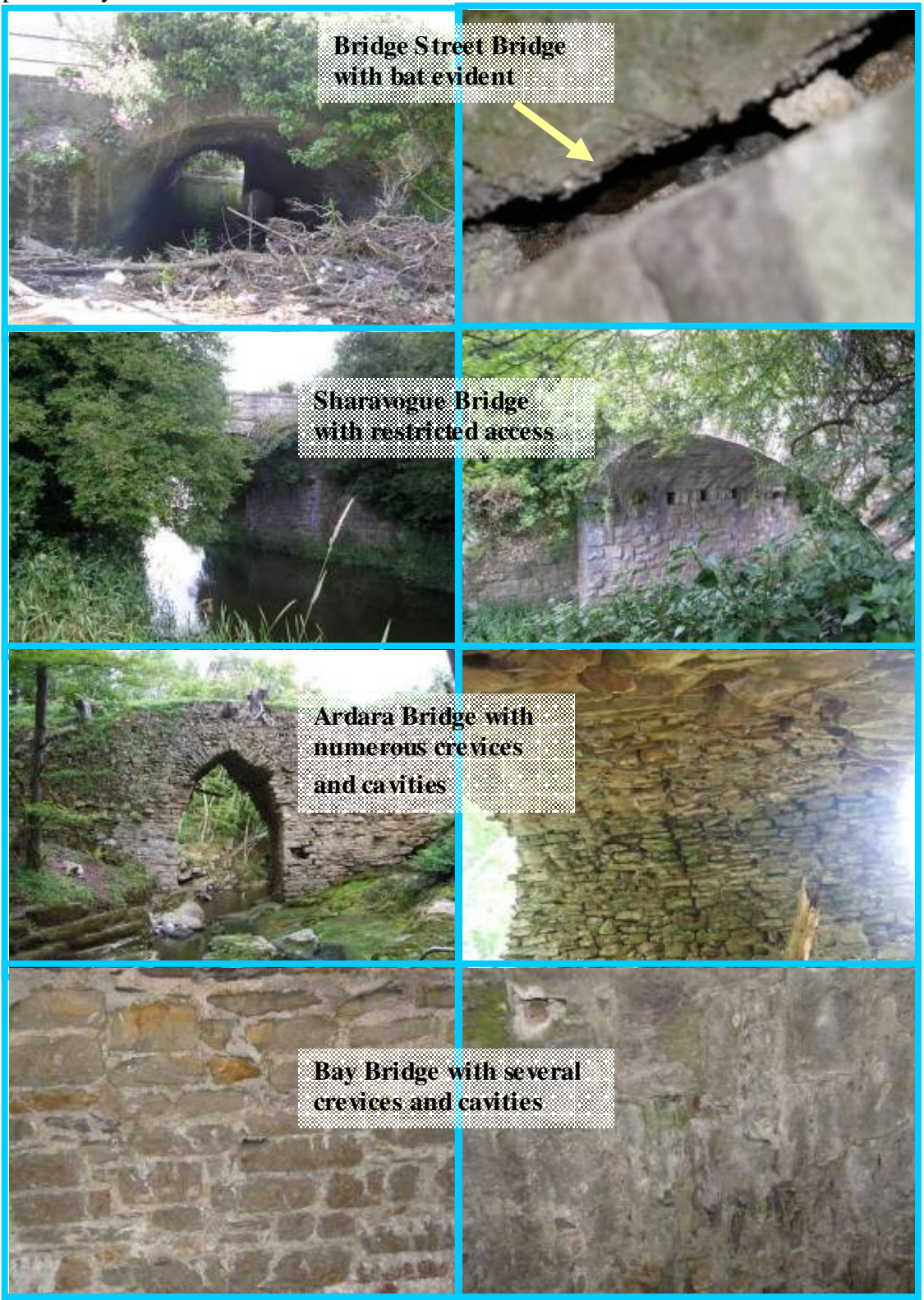
Plate 1: Bat detector surveys of bridges

A number of bridges (both "suitable" and "unsuitable" types) were re-assessed on a second or third visit to determine whether bats were present in bridges that had previously had or had not been a roost site.