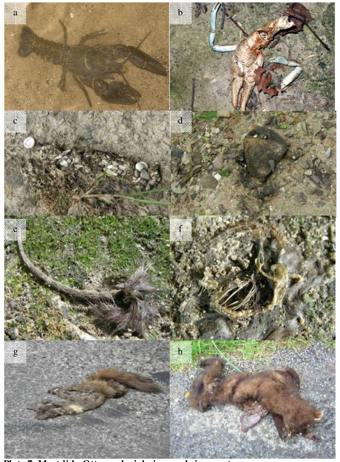
Plate 7: Mustelids: Otter and mink signs and pine martens