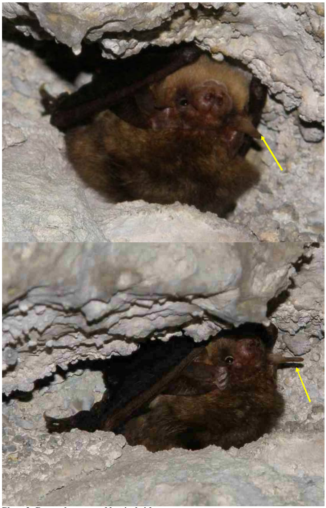
Plate 3: Brown long-eared bat in bridge.

Once the ear is folded, the tragus (see arrow) may look deceptively like an ear and lead to misidentification. Natterer's bat is the species with which it is most commonly confused