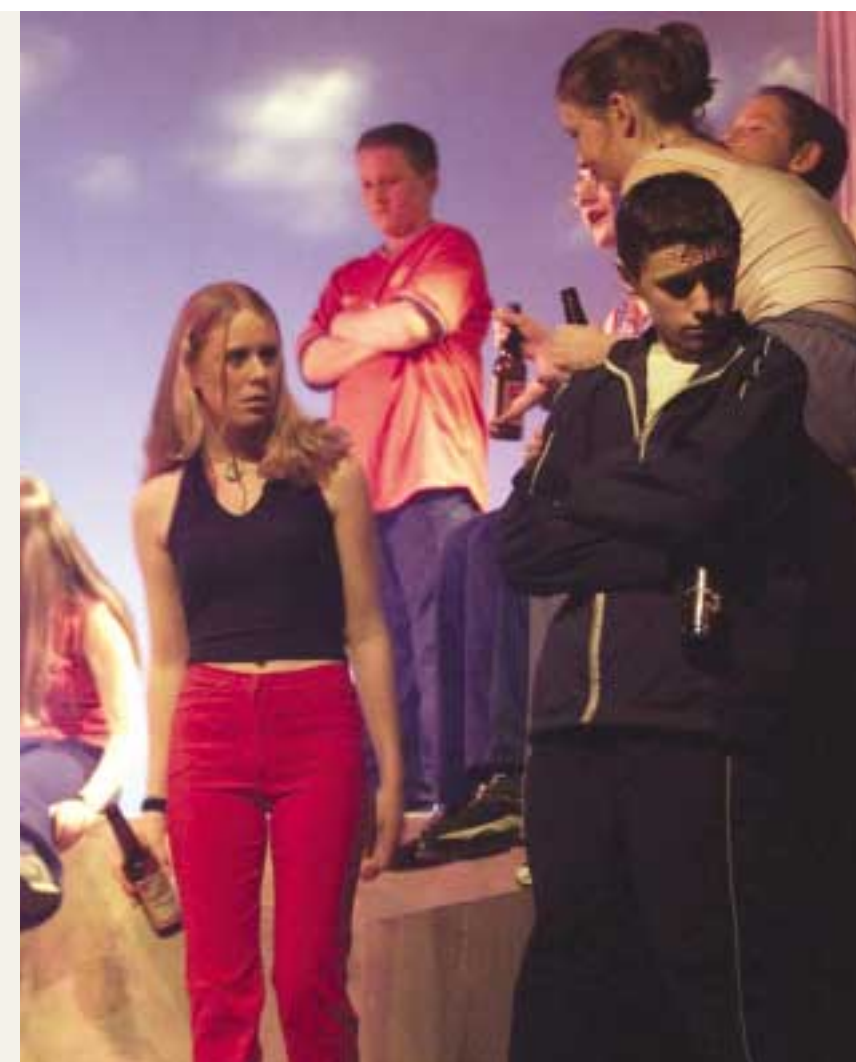
Laois Youth Theatre