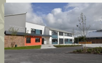
New Primary School Campus, Aughnaharna,