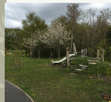
Regeneration of Pairce Uí Phobail