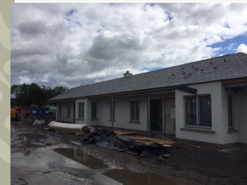
New Housing Conniberry Way, Old Knockmay