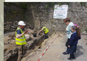
Fort Protector— Archaeological Testing in the site of the new Library, Main Street