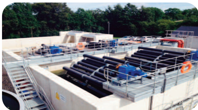
Abbeyleix Waste Water Treatment DBO

The 'Laois Grouped Towns Sewerage Scheme (DBO Contract)', two year contract of €11,439,869, was awarded in June 2013 to Response Engineering Ltd /Ward & Burke Ltd joint venture. This scheme involves the construction of new wastewater treatment plants in five Towns (Abbeyleix, Durrow, Stradbally, Rathdowney, Mountrath). New plants have been constructed and are now operational in four of the towns and it is expected that Stradbally will be operational by March 2015.