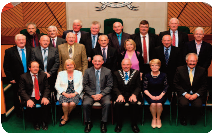
Elected Members with the County Manager at Laois County Council AGM in June, 2014

Laois County Council consists of 19 Elected Members - six members each from the Borris-in-Ossory-Mountmellick and Graiguecullen-Portarlinton Municipal Districts and seven members from the Portlaoise Municipal District.