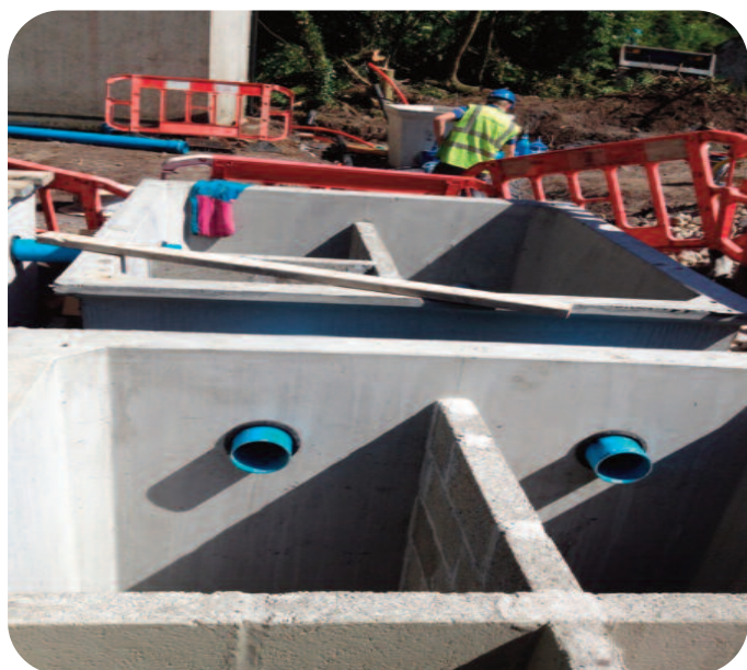
Five Well, Abbeyleix - recommissioned in 2014

ological compliance rate and 99.3% chemical compliance rate.