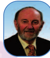
John Bonham