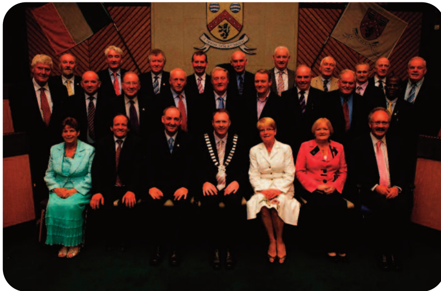
Elected Members with the County Manager at Laois County Council AGM in June, 2009

Laois County Council consists of 25 Elected Members - four members each from Mountmellick, Emo and Luggacurren Electoral Areas, six members from the Borris-in-Ossory Electoral Area and seven members from the Portlaoise Electoral Area.