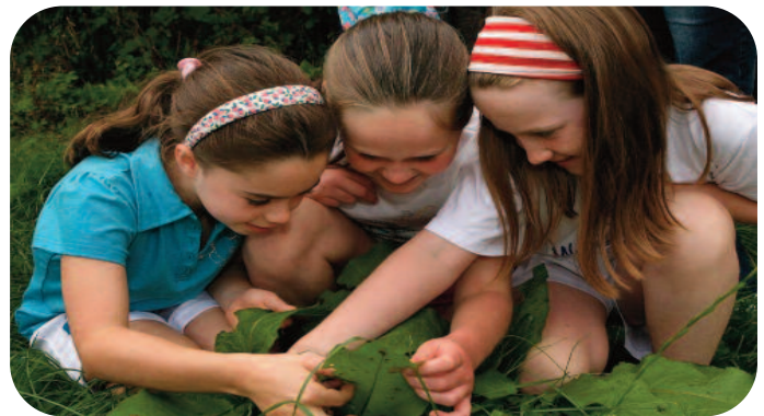
Heritage Week walk on the Grand Canal, Vicarstown

In association with The Dunamase Arts Centre, a series of Living Architecture Workshops were presented at sites around the county in June and July.