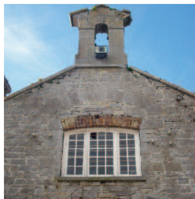
The Dining Hall at Donaghmore Workhouse, now scheduled for restoration (Photo: MCOH Architects)

has been derelict for some time. It is intended that, subject to the availability of funds, the restoration project will start in 2011.