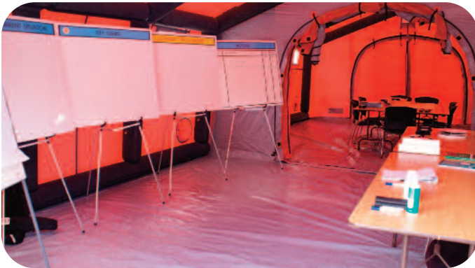
Major Emergency Management Controller of Operations Tent

The Major Emergency Plan was amended in March and distributed to all relevant personnel. All relevant sections amended the MEM Section Response Plans, Emergency Sub Plans and Risk assessments.