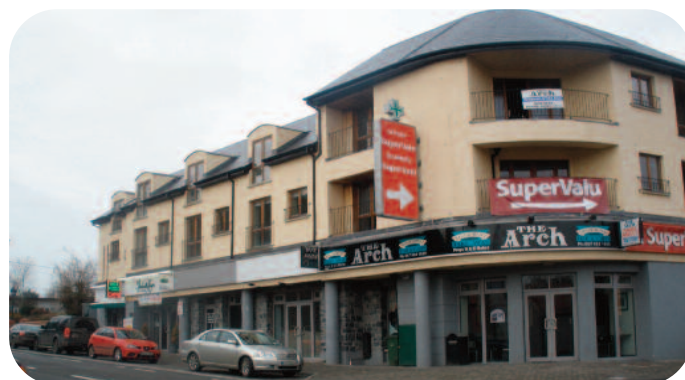
Part V Units at Vale View, Stradbally

In accordance with Part V of the Planning & Development Act 2000, 2 housing units (social) were completed in 2010.