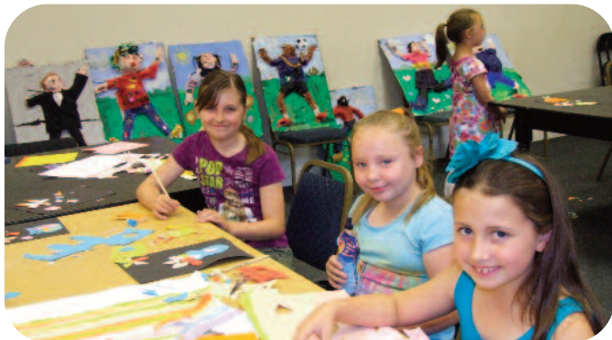
Summer Arts Programme

The workshops were held in different parts of the county and included the following art practices: visual art, pottery, creative writing, drama, dance and kindermusic.