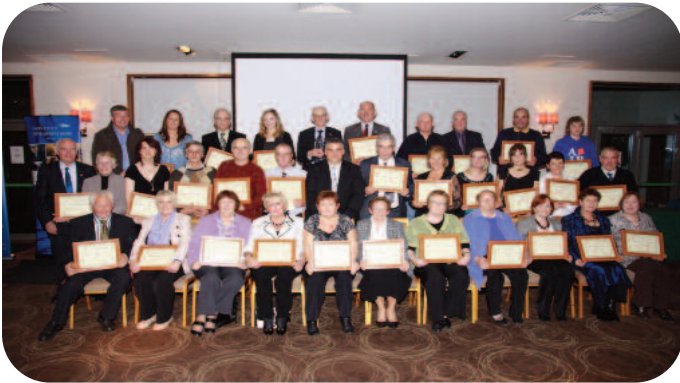
Community Awards 2010 - Nominees & Winners

Laois Community Forum hosted its 2nd Annual Community & Voluntary Awards Ceremony on 3rd November, 2010 in the Killeshin Hotel, Portlaoise. The Awards were also held in association with Laois County Council Heritage Office and Laois Sports Partnership and aimed to recognise the tremendous contribution made by community and voluntary groups to life in County Laois.