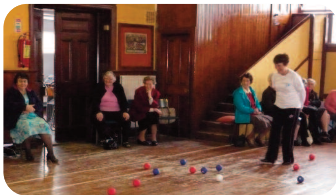
Older Persons Activity Day - Mountrath 2010

Successful Networking Days were held in Mountrath, Borris-in-Ossory and Rathdowney, in association with Laois Sports Partnership and Laois Partnership, which included talks and discussion on issues which affect older people, e.g., nutrition, personal safety, healthcare, keeping active, etc. Activities e.g., sit-fit, music, dance, bocchia (bowls) and arts/crafts were also provided at each event.