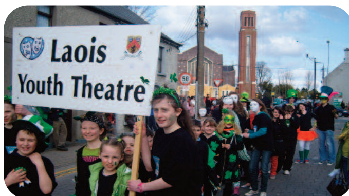
Laois Youth Theatre taking part in the St Patrick's Day Parade

Laois Youth Theatre worked in Portlaoise, Stradbally, Mountrath, Portarlinton and Rathdowney during the year.