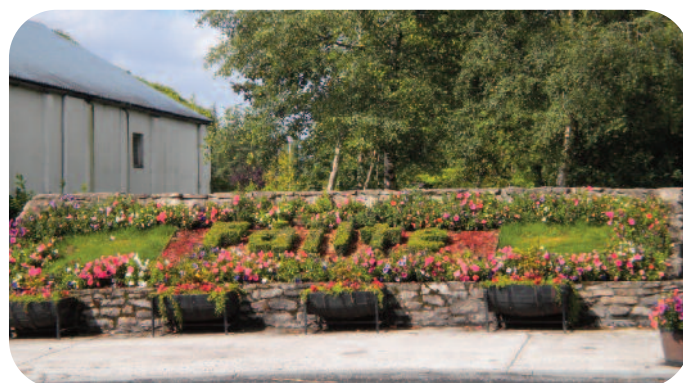
Mountrath - Overall winner 2010 Local Tidy Towns Competition

Laois Federation of Tidy Towns was established in 1998 and at present has 26 registered groups. These groups have been conserving and enhancing the local environment in their community and are an invaluable resource. Laois County Council is actively working with the Tidy Towns Committees to help invest in their future and ensure continued growth and development.