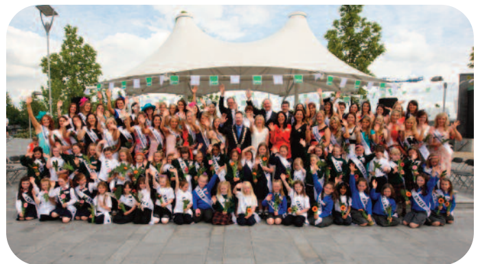
International Rose of Tralee Regional Finals 2010