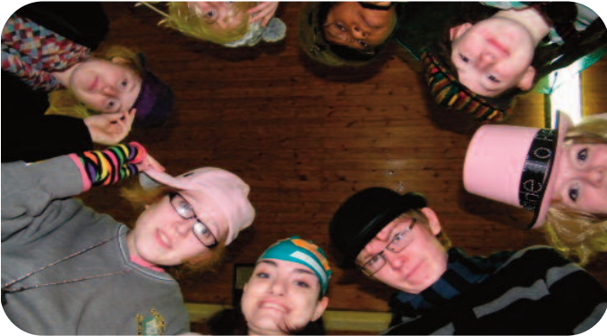
Laois Youth Theatre 2010

As well as weekly workshops the programme included a colourful end of year performance in the grounds of Emo Court on 29th May. The Portarlington group gave a performance for family and friends on 28th May.