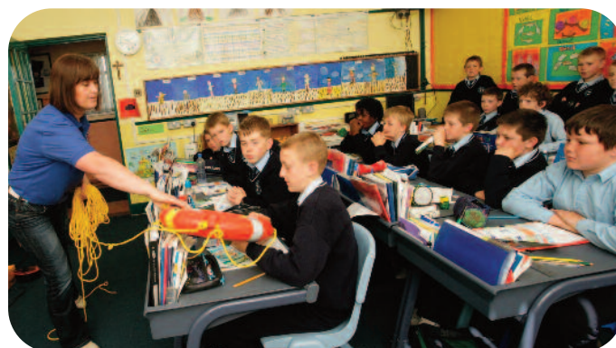
Water Safety Awareness Week - Ballyroan N.S.

were also shown how to use a ring buoy and the importance of them on lakes, rivers and ponds around the county. All children in the schools were very receptive to the presentations. Wolfhill N.S. were the winners of the poster competition.