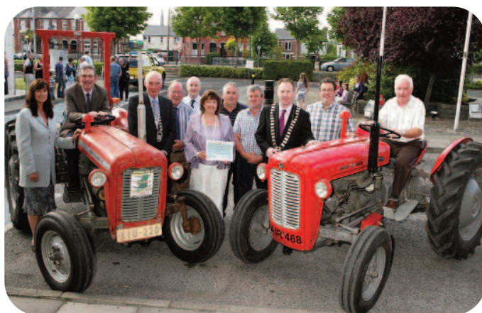
24th June, 2010 – Cathaoirleach's Reception in honour of the Red Eagles Group