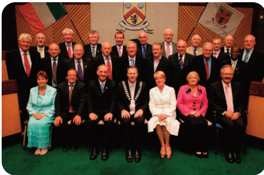
Elected Members with the County Manager at Laois County Council AGM in June, 2009

Laois County Council consists of 25 Elected Members - four members each from Mountmellick, Emo and Luggacurren Electoral Areas, six members from the Borris-in-Ossory Electoral Area and seven members from the Portlaoise Electoral Area.