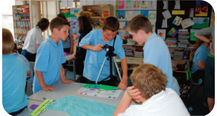
The Artists in Schools Project in Borris-in-Ossory

The Artists in Schools Scheme ran in 10 schools in 2010. The Scheme allows students to have an in-depth experience with the professional artist and gives them the opportunity to experience different art mediums.