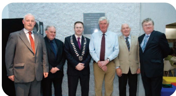
Official Opening of Mountmellick Library & Art Gallery

In May, Mountmellick Library and Art Gallery was officially opened by John Moloney, T.D. Minister for Disability and Mental Health.