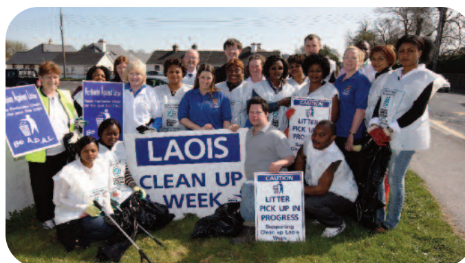
Clean Up Laois Week 2010

Clean up Laois Week ran from 12th to 16th April 2010. Organised in conjunction with An Taisce's Spring Clean and now in its seventh year, this is one of the Council's biggest clean up initiatives and 2010 saw the largest number of groups participating.