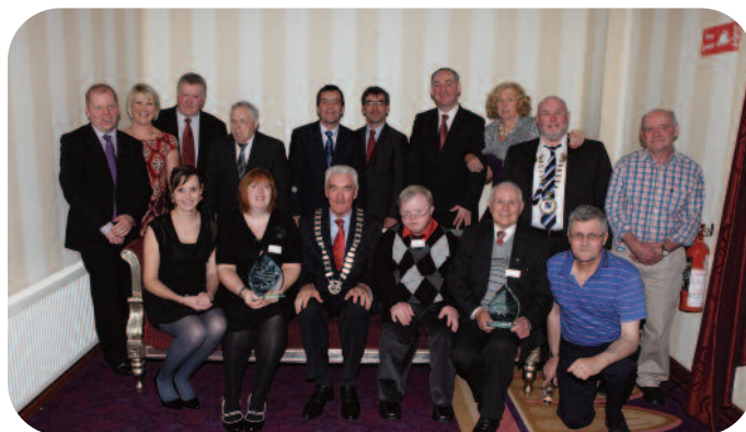
Pride of Place - 2010 Prizewinners

Winner of an Adjudicator's Special Endeavour Award were the residents and staff of the Green Cottages, Stradbally. Previously cottages to families employed on the Cosby Estate and more recently derelict and an eyesore on the road to Carlow, the Sisters of Charity of Jesus and Mary undertook, in collaboration with Laois County Council, Health Services Executive and the local community in Stradbally, the development of a project, to restore and preserve the cottages, while also developing a place where men and women with intellectual disabilities could live with the appropriate care and support both within the Cottages and out in the community.