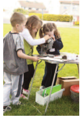
Learning about wildlife in Kirwan Park, Mountmellick during Biodiversity Week

In association with The Dunamase Arts Centre, a series of Living Architecture Workshops were presented at sites around the county in June and July.