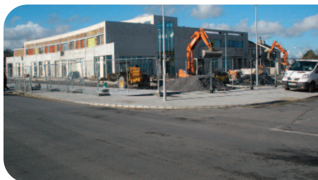
Portlaoise Resource Centre

The contract for the construction of the building was signed in November, 2009 and work commenced on site shortly thereafter. The official handover date is March, 2011. A Management Company, Treo Nua Ltd, was established in 2010 to manage the complex.