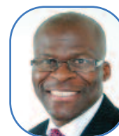
Rotimi Adebari (Non Party)