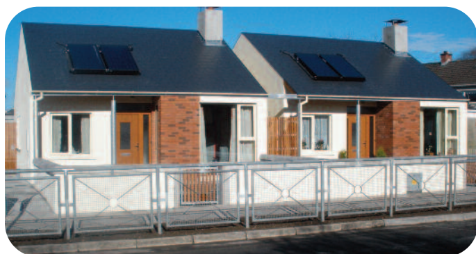
Harpur's Lane, Knockmay