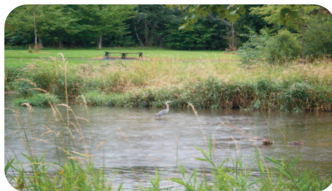
People's Park River and Lake

The Peoples Park and the River Triogue Park and Linear Walk in Portlaoise Town continue to provide recreational open space for residents and visitors alike. This year the Parks were full of wildlife despite the falls of snow and heavy rain during the year. Small garden birds, swans, ducks, a little grebe and heron are regular visitors, enjoying the tranquillity on the lake. The adult fitness and exercise equipment in each of the two parks is benefiting many people who use the different pieces of equipment on a daily basis. This fitness equipment aids in the recovery process from illness or surgery.