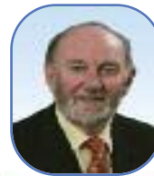
John Bonham