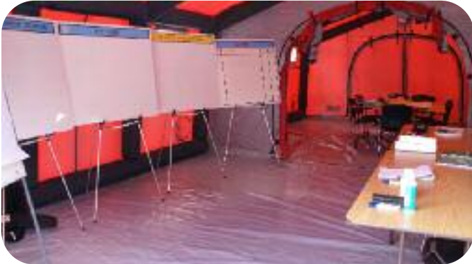
Major Emergency Management Controller of Operations Tent

Additionally, all necessary equipment and communications were also purchased.