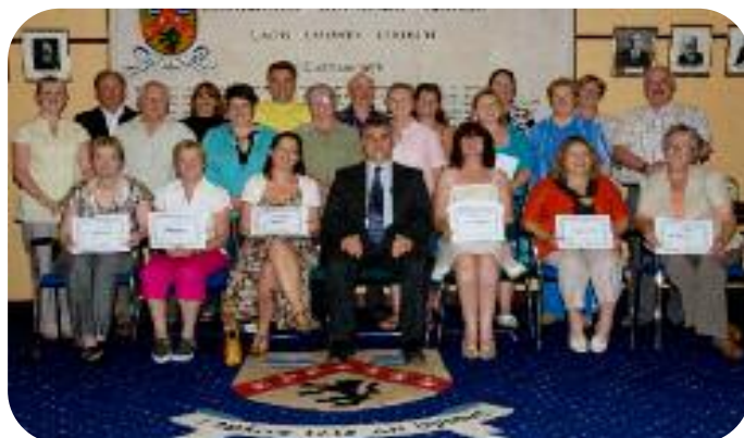
Youth Projects Grant Winners 2009

Laois Community Forum celebrated its young people through grants awarded for youth projects in June, 2009. 10 Groups were awarded grants to assist with projects which would positively enhance the quality of life for young people in our county.