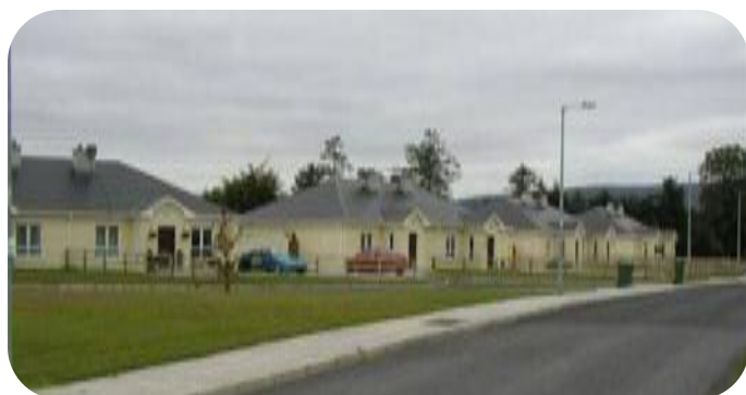
Housing at Camross

During the year, 71 houses were completed or purchased under this Programme. The breakdown is as follows: