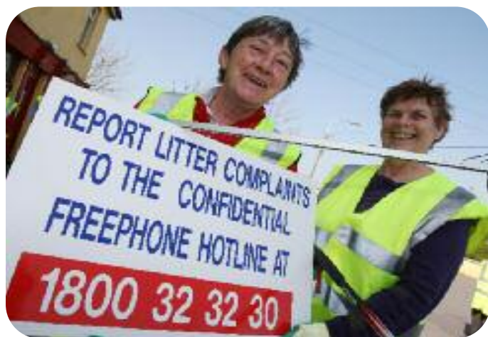
Portlaoise Against Litter Clean-Up Week 2009

The Environment Section continues to promote, encourage and participate in initiatives throughout the year, building on from previous years' experience, to ensure maximum participation and a positive outcome.