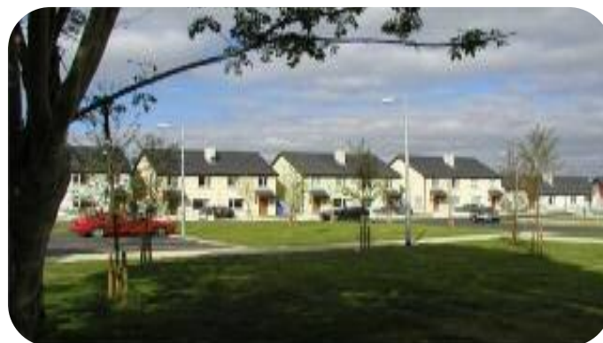
Voluntary Housing at Clanmalire

Award certificate and cheque for €200.00