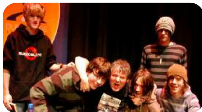
Author Darren Shan at Abbeylax Library

Abbeylax Library had a hugely successful Children's Book Festival with an Author visit by Darren Shan. The visit by the well known children's author was held in Dunamais Theatre in Portlaoise with tickets distributed to library users and avid fans.