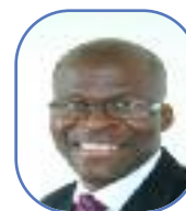
Rotimi Adebari (Non Party)