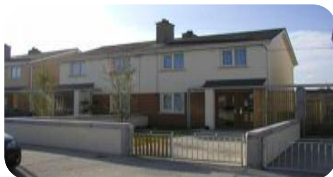
Oakleaf Place, Knockmay

completed in December, 2009. The physical works included improvements to the houses, demolition and replacement of some dwellings, removal of alleyways, redesign of open spaces and the construction of boundary walls.