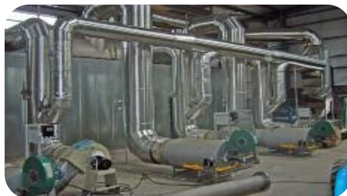
Portlaoise Waste Water Treatment Plant

The Design-Build-Operate contract, for construction of the Portlaoise Waste Water Treatment Plant, commenced in 2007. Construction was substantially completed in 2009 and 20 years operational contract is commenced.