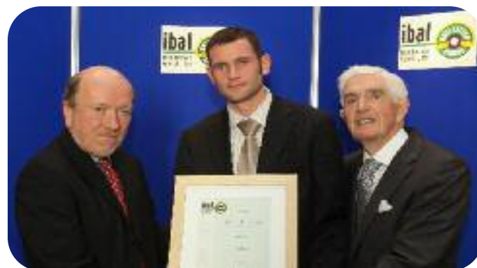
Irish Business Against Litter Awards Ceremony 2009