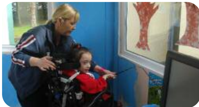
Artists Project in the Kolbe Centre

The Artists in Schools Scheme ran in 12 schools in 2009. The Scheme allows students to have an in-depth experience with the professional artist and gives them the opportunity to experience different art mediums. An exhibition of some of this work took place in Áras an Chontae in December and a booklet was also produced.