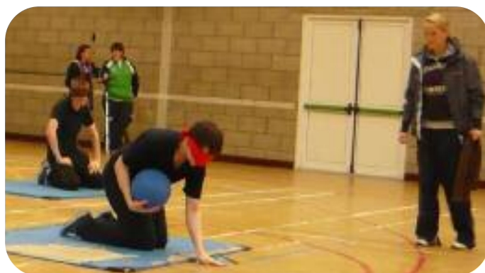
Laois Community Forum and Laois Sports Partnership Disability Awareness Training

association with the rollout of a pilot program in Heywood Community School.