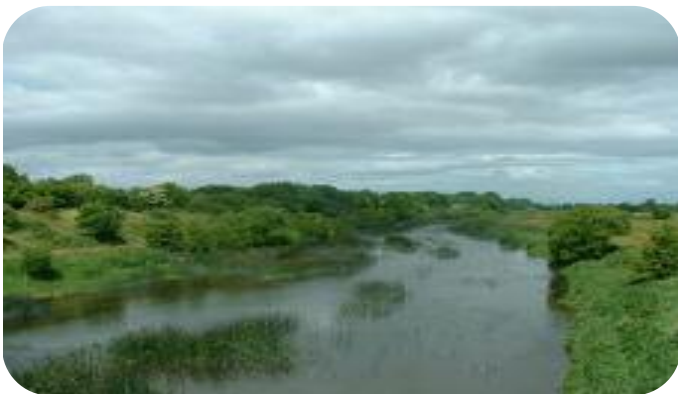
River Barrow near Vicarstown, surveyed as part of the Laois Habitats Survey