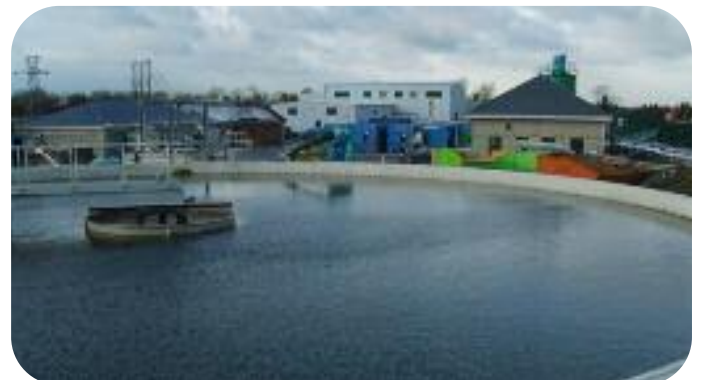
Portlaoise Waste Water Treatment Plant

The Water Services Section is responsible for the provision and maintenance of adequate water supplies and wastewater treatment and disposal facilities which comply with both the EU Drinking Water Directive and EU Urban Waste Water Treatment Directive. Laois County Council currently supplies approximately 24,000 cubic meters of water per day. The volume of unaccounted for water currently stands at 34%, which is better than the national average.