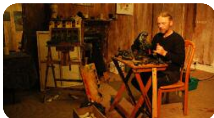
The Method Project, part of the Magnet Festival