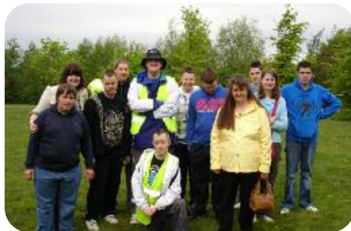
Students from the National Learning Network on Work Experience

During National Tree week many schools, resident associations and Tidy Towns groups received sapling trees from Laois County Council. These saplings were provided by the Tree Council of Ireland in conjunction with sponsors O2 and Coillte.