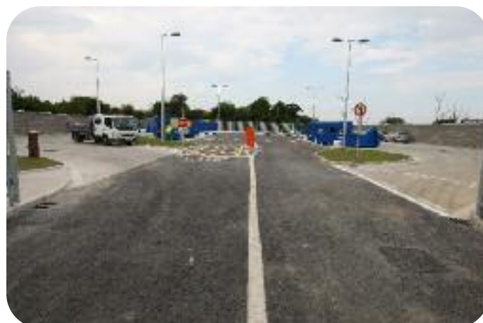
Portarlington Recycling Centre

A total of 44 recycling bring banks were in place throughout the county by the end of 2009. Portarlington Civic Amenity Centre (Recycling Centre) was opened to the public in June, 2009. The contract for the management and operation of the facility was awarded to AES Ltd. for 2 years with effect from June, 2009. The facility is open on Monday, Wednesday, Friday and Saturday of each week.