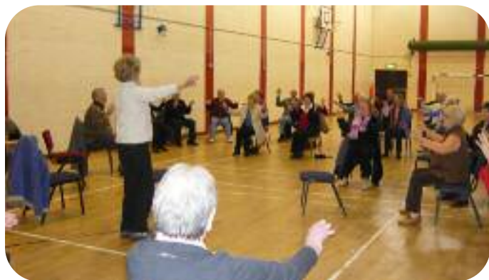
Community Forum Older Persons Activity Day in Portarlinton

5 Networking Days were held in association with Laois Sports Partnership and Laois Partnership, which included talks and discussion on issues which affect older people, e.g., nutrition, personal safety, healthcare, keeping active, etc and activities e.g., sit-fit, music, dance, bocchia (bowls) and arts/crafts.