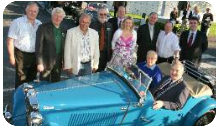
Reception for Gordon Bennett Classic Car Run at Aras an Chontae

The Gordon Bennett Event and Route is an invaluable tourism attraction in its own right and links numerous tourism and heritage sites.