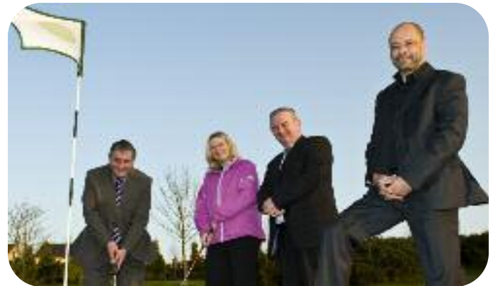
Launch of the Laois International Golf Challenge