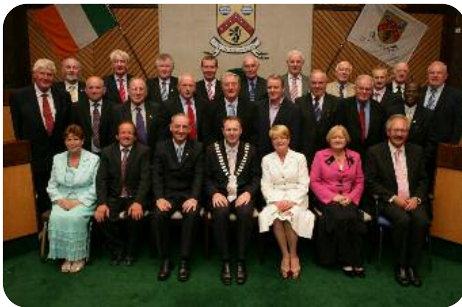
Elected Members with the County Manager at Laois County Council AGM - June, 2009

Laois County Council consists of 25 Elected Members - four members each from Mountmellick, Emo and Luggacurren Electoral Areas, six members from the Borris-in-Ossory Electoral Area and seven members from the Portlaoise Electoral Area.