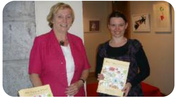
Launch of 'Wild Things at School'

A major publication on the promotion of wildlife awareness in schools was produced during 2009. The book "Wild Things at School" was published in co-operation with Monaghan and Meath County Councils, and was written by well-known wildlife author Eanna ní Lamhna.