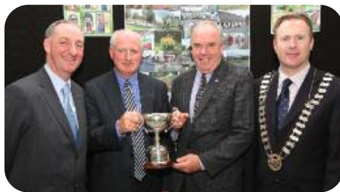
Mountrath - Tidy Towns Award Winners 2009

Assistance was provided to the groups in the form of the Tidy Towns Grants, Summer Wheelie Bin Scheme, participation in Clean Up Laois Week, the Laois Federation of Tidy Towns Competition and Awards.