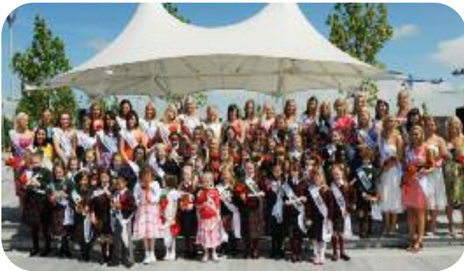
Rose of Tralee Contestans and Rosebuds at Áras an Chontae

The Rose of Tralee Regional Finals took place for the third time outside Tralee and was held in Portlaoise in 2009. It was a great success and a fantastic opportunity to showcase the county. The organisers of the International Rose of Tralee work in conjunction with the Tourism Officer and the sponsors and hotels in organising all of the activities during the 5 day event. The Roses participated in tours around the county to view the tourism attractions in Laois. A photo shoot took place at Emo Court and the Roses also visited the Laois Craft Centre. A number of local pubs officially 'twinned' with the Roses which offered entertainment for families and friends.