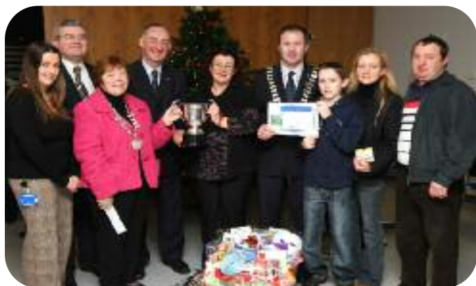
Newtown - Overall Winners of the 2009 Art From Waste Award

The 2009 Awards saw Laois County Council acknowledge and reward various community groups throughout the County for their involvement in the Laois Federation of Tidy Towns, the Inter Community Litter Challenge and the Community Action Project.