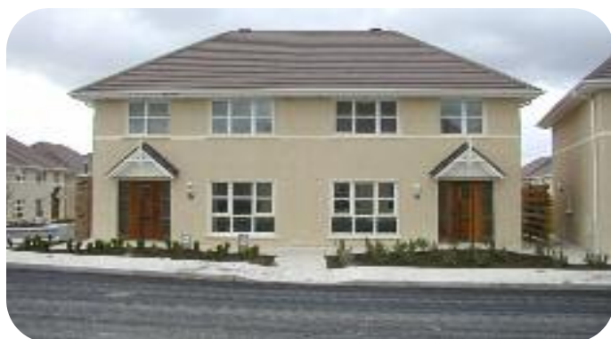
Affordable Housing at Maryborough Village, Portlaoise

There are currently houses for sale in Portlaoise.