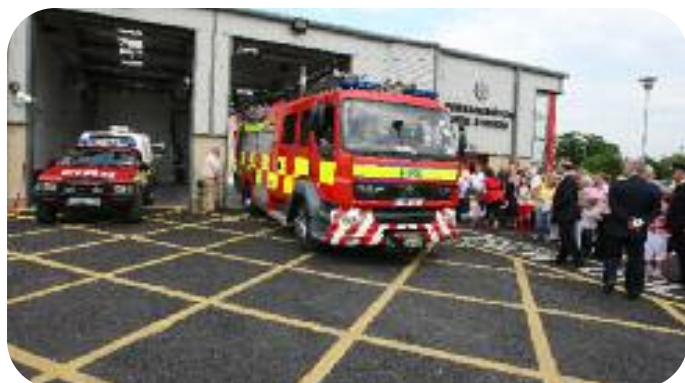
Portarlington Fire Station, officially opened in June 2009

The operational service responded to 745 incidents in 2009. Of these 391 were fires and the remaining were special service calls; 64 road traffic accidents, 45 incidents of flooding, 17 hazardous substances in transport and 228 other miscellaneous incidents.