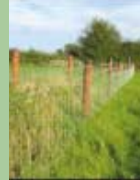
Coppiced hedgerow fenced. Temporary fencing should be sufficient, provided new growth is routinely trimmed correctly, resulting in a stockproof hedgerow.