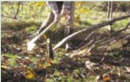
Cleaning the stump